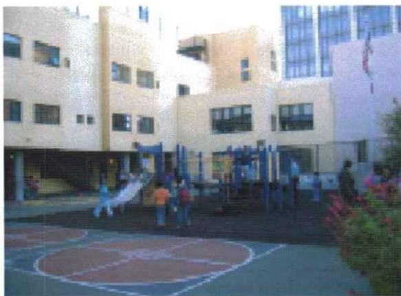
by Martin Zimmerman

One such function is the downtown public school, once a casualty of the wrecking ball in the days of urban renewal. This new generation of public schools is dubbed by a host of enthusiastic observers as a "new-building type", characterized by an integrated, even global mix of students, creative and discerning architectural forms, updated curricula, and partnerships with community institutions and services. What follows are capsule descriptions of three successful ventures: San Fran-